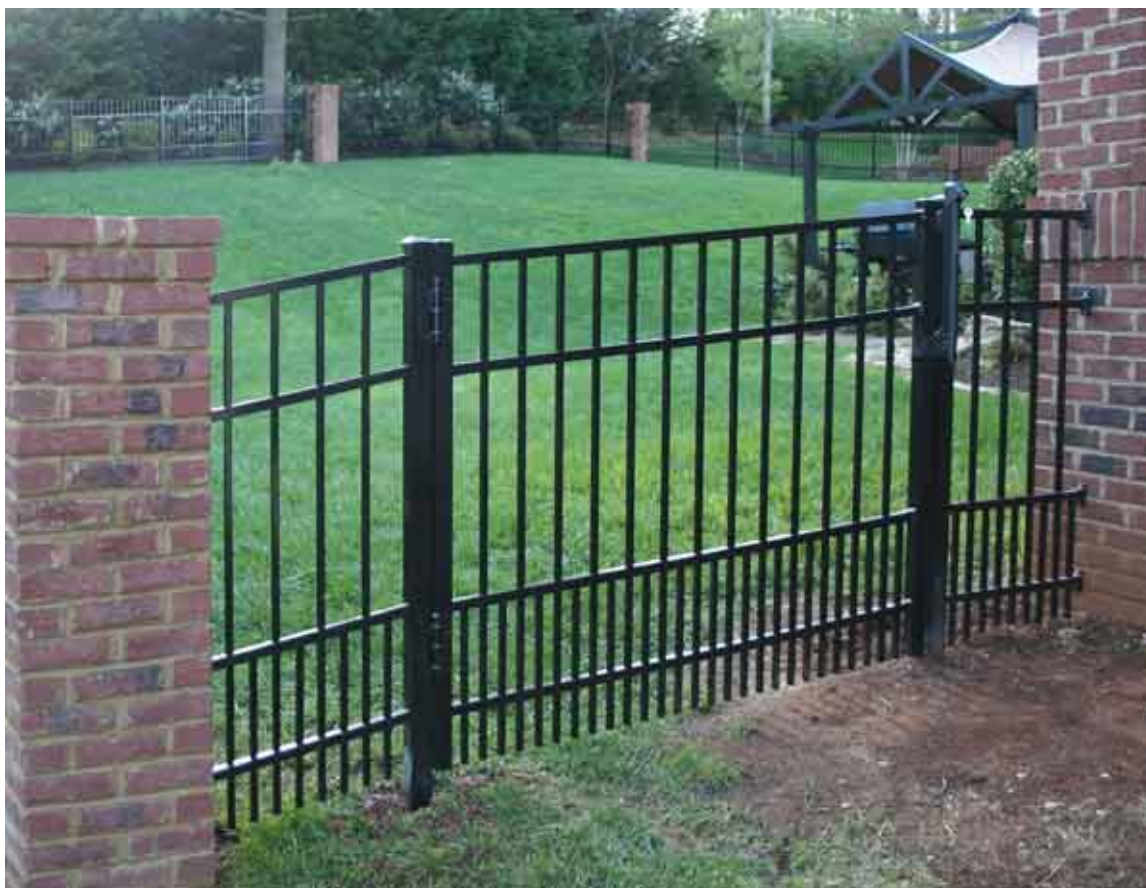
LANDSCAPE GATE - WHITTINGTON CREEK – ALUMINUM PUPPY RAIL

You will most likely want at least one gate that is about 5' wide so that landscapers and large lawn mowers can enter into your fenced yard. This access gate is not decorative and should match in with the existing fencing. Even if you cut your own grass and do not need a larger gate now, you may need one in the future and most larger gates are only $25 to $50 more than a regular gate (during fence construction). Some customers like to include a second gate that may so that they have access on both sides of the house.